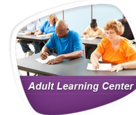
Adult Learning Center

This center provides valuable resources that help college students strengthen their academic skills, prepare for placement tests, and get ready for graduate school entrance exams.