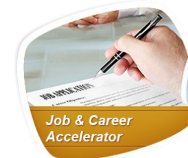
Job & Career Accelerator

Earning a high school equivalency credential can open the door to better income, a more fulfilling job, and a college education. If you are preparing for the GED® test, HiSET® or TASC™ exams, our practice tests, Interactive tutorials, and eBooks will help you reach your goal.