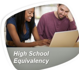
High School Equivalency

Getting into college is an important step to building a strong future. First, you must do well on your college admission tests and write a personal essay that highlights your special talents. Use this center to get the resources you need to achieve your college preparation goals.